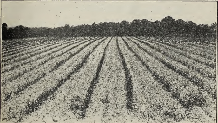
This shows a block of Cal. Privet coming one year, photographed July 10, 1924. Note excellent growth at this time. These are making up fine in 12 to 18, 18 to 24 and 24 to 36 inch grades. We have about 250,000 to offer.

See low prices on California Privets. Prices quoted are for trees Packed and Delivered at Westminster Freight or Express Office.